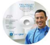
Protect confidential information with PP-100N Security model